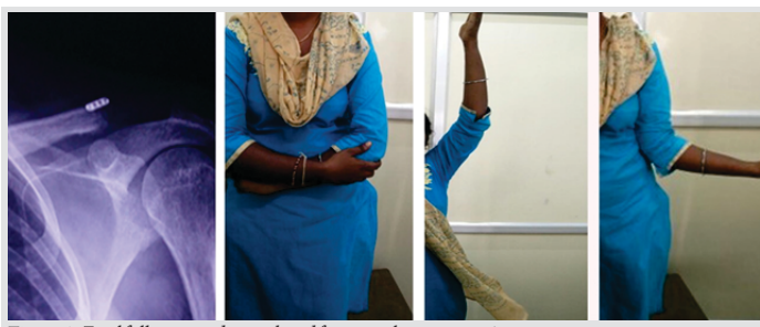
Figure 3: Final follow-up radiograph and functional outcome at 4 years post-surgery.

for 9 months without any complications. At 4-year follow-up, she had excellent clinical outcome scores of 46/60 and 88/100 as measured with Oxford Shoulder Score [8] and Nottingham Clavicle Score [9], respectively, as shown in (Fig. 3).