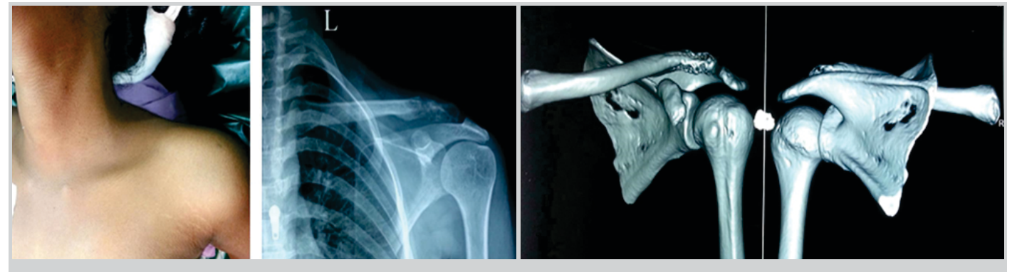
Figure 1: The clinical and radiological evaluation of the osteolytic lesion in the lateral end of the clavicle.

of constitutional symptoms suggestive of infection or tumor.