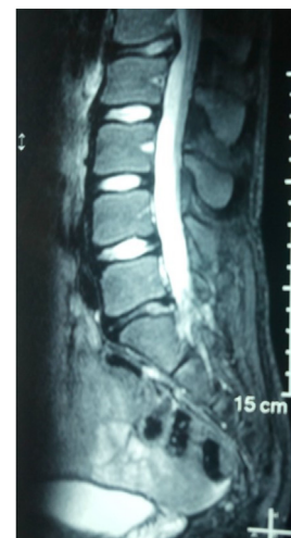
Fig. 3. MRI one year post interlaminar discectomy, showing no disc herniation at the L5-S1 level.

The child was given a trial of conservative management with analgesics and muscle relaxants for 2 weeks. However, there was no significant improvement in symptoms. Considering the inadequate response to conservative measures and the presence of bladder symptoms, early