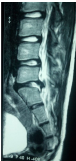
Fig. 2. MRI showing lumbar disc herniation and annulus fibrosis tear at the L5-S1 level.

The acute onset of pain and preceding history of lifting heavy suggested a traumatic aetiology. The presence of bladder symptoms, sensory loss and absent ankle jerk suggested possible nerve impingement, corresponding to the S1 nerve root being compressed. The MRI findings