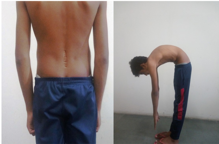
Fig. 4. Child at one-year postoperative follow-up, showing good functional outcome with normal extension and flexion of the spine.

operative treatment was recommended. We performed an interlaminar discectomy at the L5-S1 level on the right side. The offending herniated disc was excised. The patient was mobilised in the immediate post-operative period.